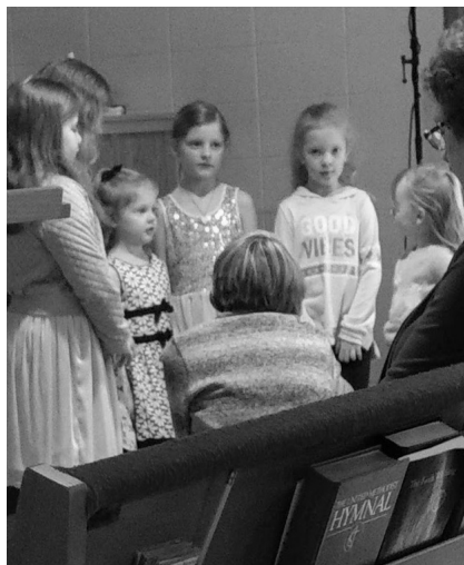
It's fun listening to the kids at Children's time during the worship service. It was especially enjoyable listening to them singing songs at the church service on April 7th.