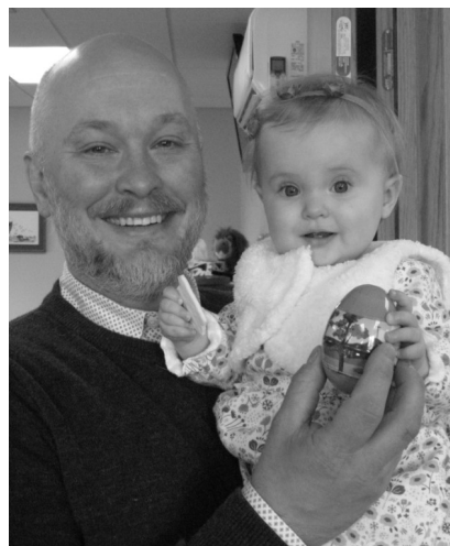
All smiles and fun at the Easter Egg hunt on April 14! All Sunday School kids participated.