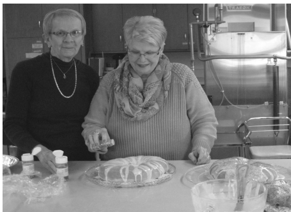
King Cake for everyone during the Umcor Presentation on March 31.