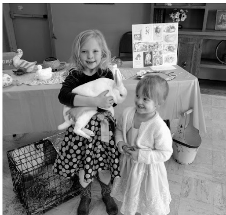
Bunnies, chicks, ducks and eggs, oh my! Our Fellowship Event on April 14 was a wonderful display enjoyed by all!